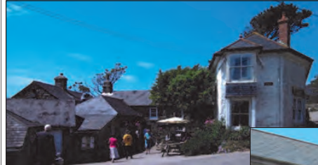
← Tinner's Arms, Zennor

Yet another warm sunny day was enjoyed by all those who came along.