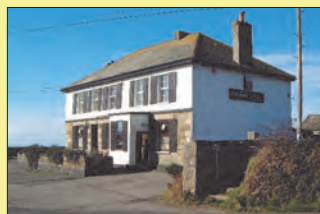
▲ Countryman Inn, Piece

Nestling on the slopes of historic Carn Brea in the rural hamlet of Piece. Delightful varied menu, and always our chef's home-made specials